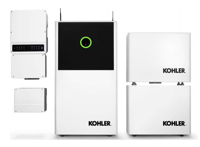
20 kWh Model