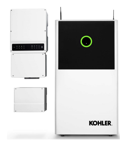
10 kWh Model

Residential Energy Storage AC and DC-Coupled